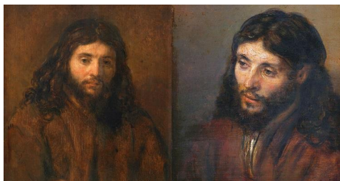
Portraits of Christ by Rembrandt van Rijn