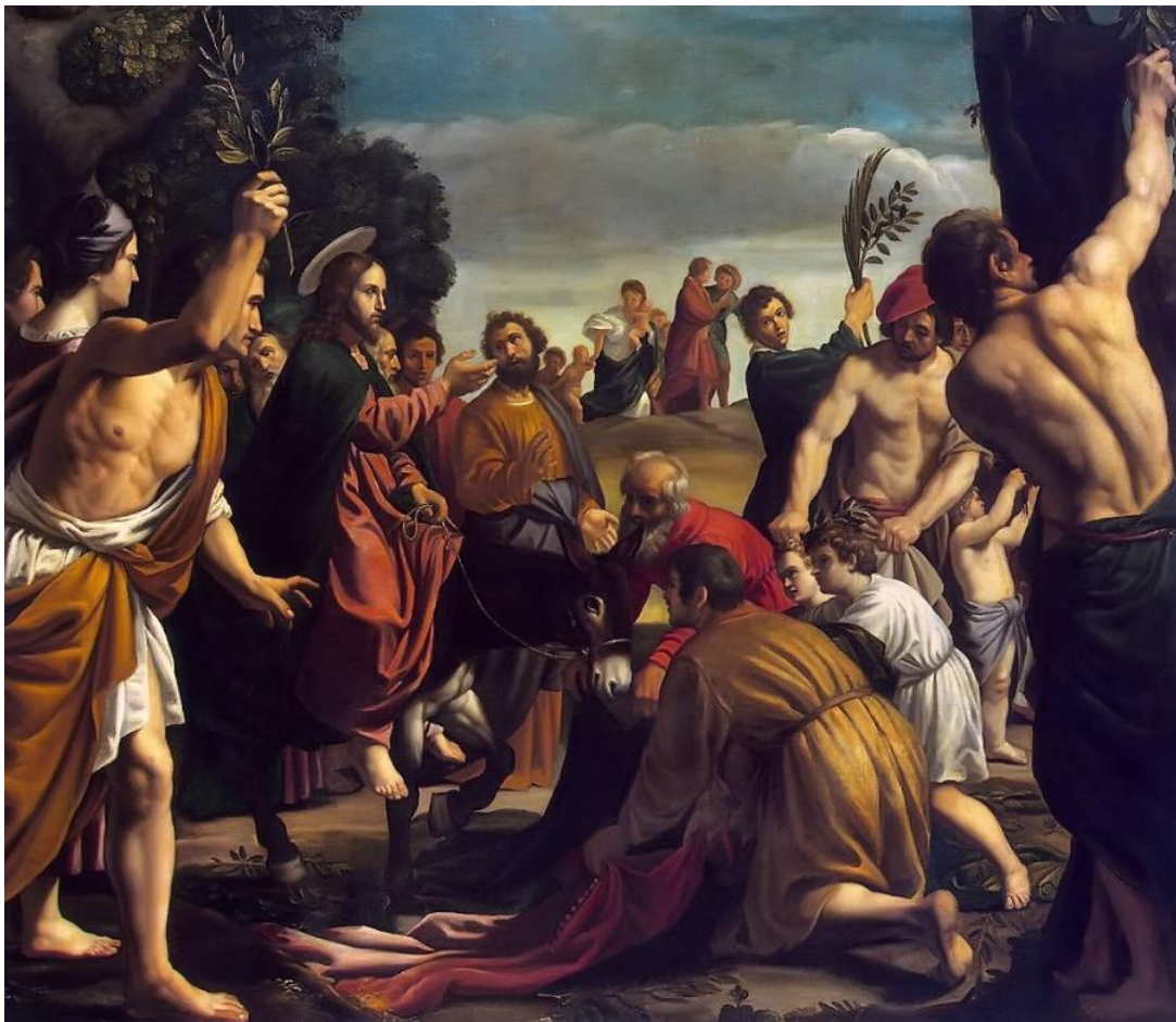
Entry into Jerusalem, Pedro Orrente, 1620

Parish Mass Book: pages 180-194, Prayer of the Church: Week 2