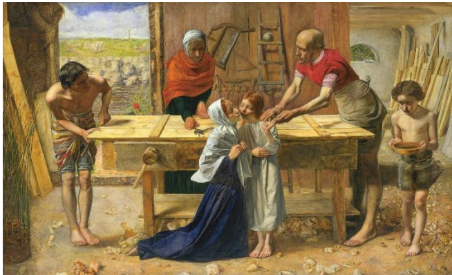
Christ in the House of His Parents John Everett Millais, 1849

10.30 am Adoration of the Blessed Sacrament