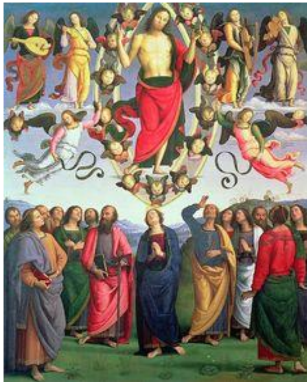
The Ascension of Christ , Pietro Perugino, 1496

Acts 1:1-11 The first reading describes the Ascension of Jesus into heaven and his promise to send the Holy Spirit to his disciples.