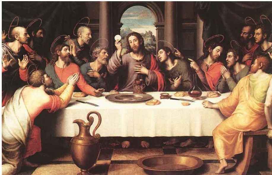
The Last Supper Philippe de Champaigne, 1602-1674

Hebrews 9:11-15 Through Christ's redeeming work, God has entered into a new and eternal covenant with his people.