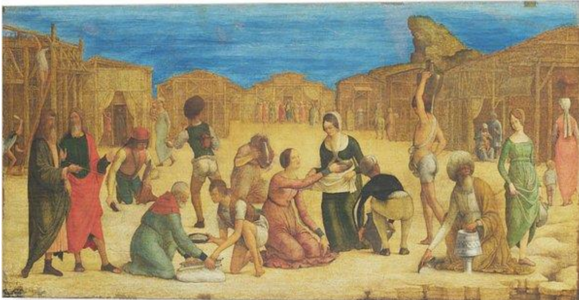
The Israelites gathering manna. Ercole de Roberti, around 1490