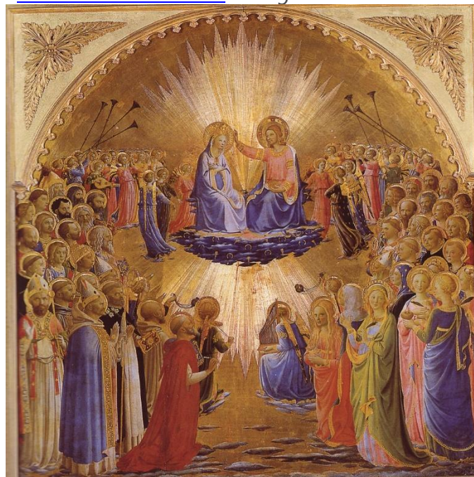
Coronation of the Virgin, Beato Angelico It is number 150 in our blue hymn book.