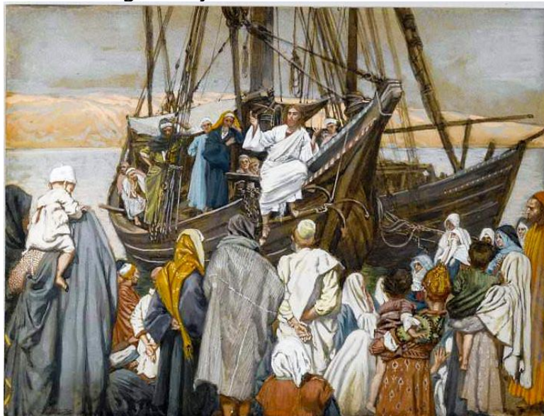
Jesus preaching from a boat, James Tissot, 1836-1902

1 Corinthians 15:1-11 Paul energetically defends the doctrine of the resurrection of the dead.