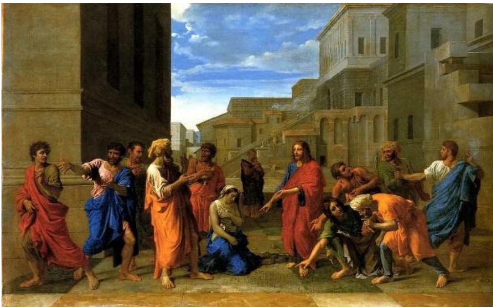
Nicholas Poussin, Christ and the woman taken in adultery 1653

Philippians 3:8-14 St Paul has willingly sacrificed everything for the privilege of knowing Christ. He hasn't yet arrived but is still running the race of salvation.