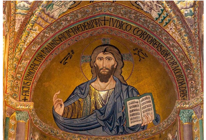
Christ Pantocrator, Cefalù Cathedral, Sicily

A deeper understanding between Christians and Jews, those who suffer persecution, oppression, and denial of Human Rights, Europe, human life, seafarers.